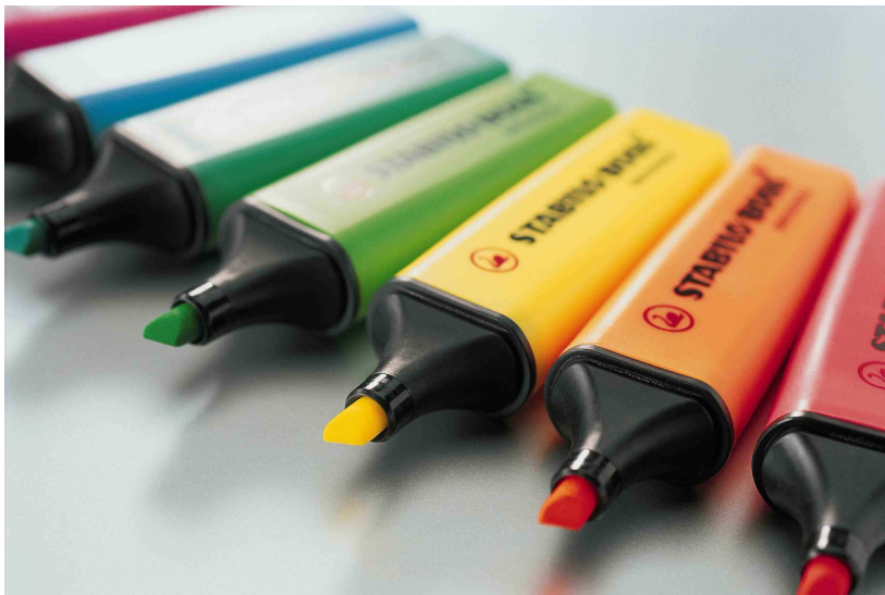
STABILO BOSS was launched 40 years ago and is manufactured at the Weißenburg site

At the start, Schwan-STABILO intended to produce fountain pens and their components in Weißenburg and to launch its URANIA brand on the fountain pen market. In the mid-1960s, however, Schwan-STABILO shifted its focus to the production of injection molded plastic pen parts to meet the demands of the modern market.